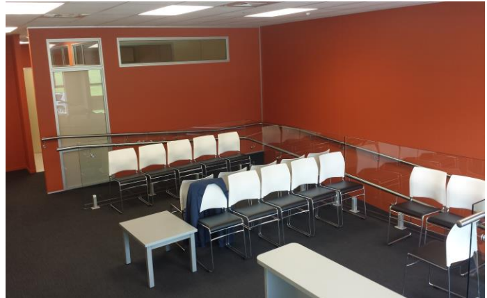
Waiting room Kamo Collection Centre