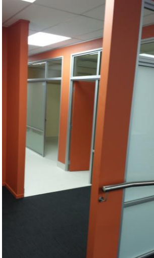
Entrance to collection rooms

Address: 1A Clark Road in Kamo Phone: 09 435 3984 Fax: 09435 3856